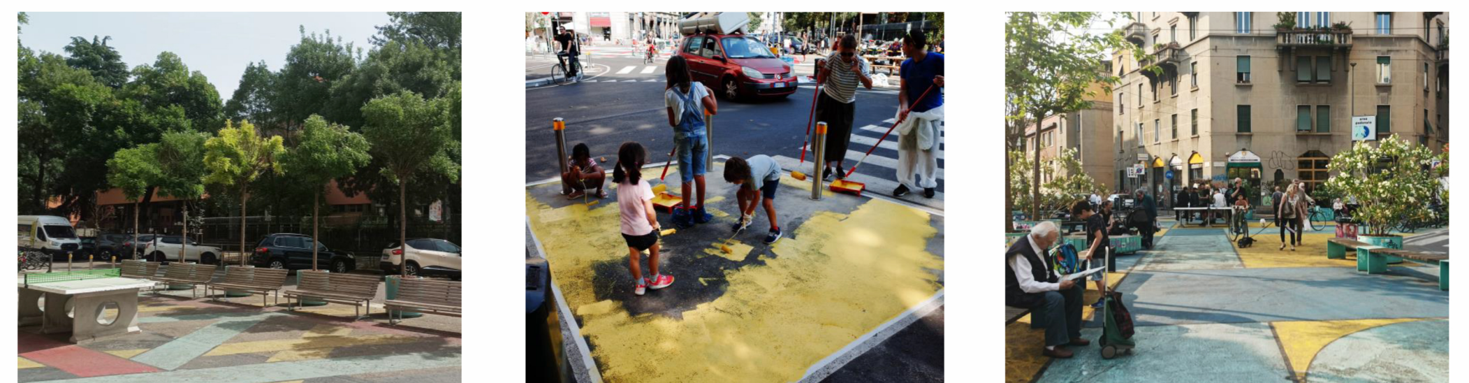
Codesign of P. Bacone (winwinoffice), and current P. Bacone & Arcobalena (author).

The evaluation model was applied to two tactical urbanism interventions, Piazza Arcobalena and Piazza Bacone, which are part of the "Piazze Aperte" project, a collaborative initiative by the City of Milan. The project aims to improve public spaces through urban regeneration and sustainable mobility, using a "tactical urbanism" approach to transform underutilized areas into communal hubs and pedestrian zones. The visual observations were conducted for 7 days at each site with three 2-hour intervals per day. For additional insight, five key informant interviews were conducted with stakeholders from different backgrounds, such as residents, academia, architects, community representatives, and government officials. The spatial analysis was used to measure tangible indicators such as micro-mobility network continuity, user's spatial distribution, neighbourhood land use evaluation, etc.